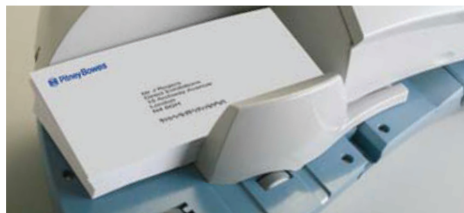
Automatic feeder quickly processes your mail