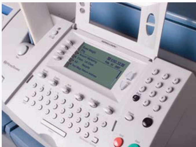
Easily add a custom text message with the qwerty keyboard

Transform your mail piece into eye-catching communications. Advertise your business on every mail piece with sharp inkjet printing to build your professional image. An optional feature allows you to print a return address or message alongside your customised slogan to ensure undelivered mail is returned thus improving the accuracy of your mailing database and ultimately reducing expenditure on subsequent mail shots. These are easily entered via a built-in qwerty keyboard.